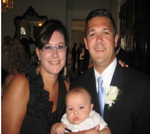
The Sutter Family